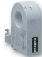
Residual current transformer ND 5015