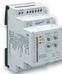
Residual current monitor RN 5883